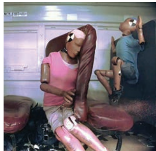
Unbelted passengers in a crash demonstration